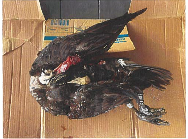
Photo depicts mid-range view of deceased Nene.